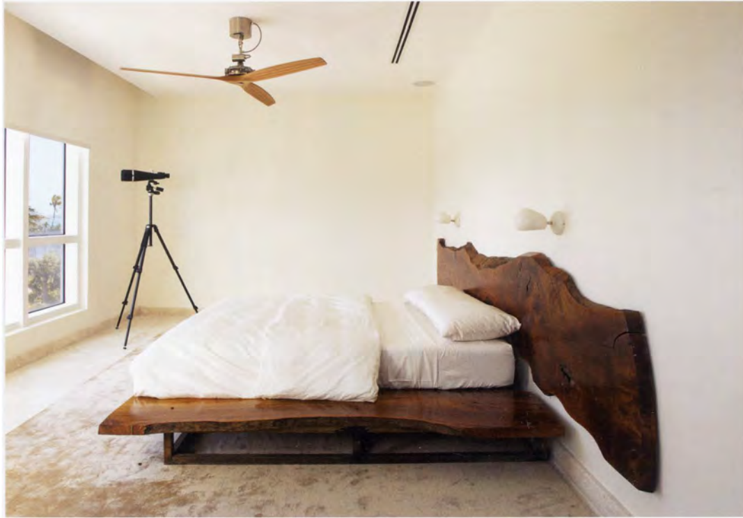
The upper level of the residence houses the minimalist master bedroom with the grand Nakashima bed and an open bath area. A soft hand tufted silk rug complements the cool coral stone floor. A sculpted wooden Boffi fan hangs above the bed. The David Weeks sconces correspond with the living room chandelier.