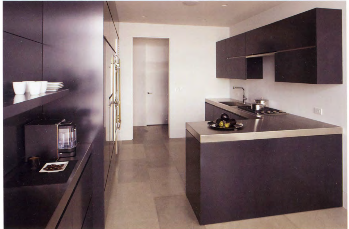
Magdalena selected warmer tones for the kitchen. Stainless steel appliances and thick stainless steel counter top complement cabinets in espresso lacquer. The Richmond gray limestone floor stretches throughout all the public spaces of the entire apartment including the kitchen.