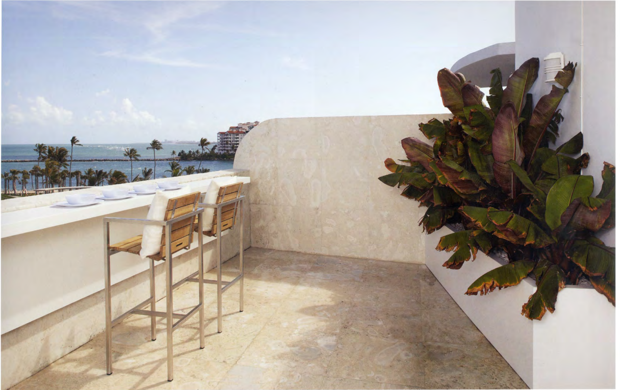
The top floor offers the best views of the Atlantic Ocean. It has a small kitchen, a bathroom, a roof deck with a bar and lounge bed, as well as an outdoor television.