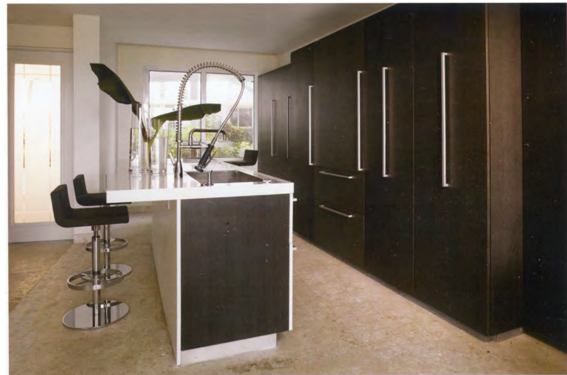
The coral stone, which is used for all floors, provides cool surfaces and unifies the open kitchen and its espresso stained wood storage with the living area. The island top extends, creating a breakfast surface. The adjustable bar stools in polished chrome are upholstered in dark brown linen.